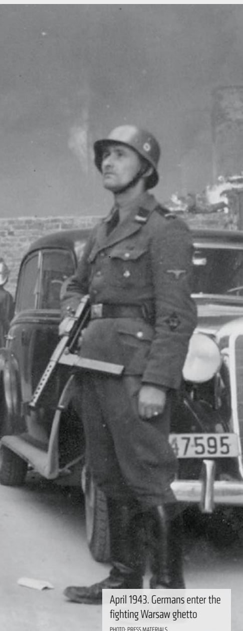
April 1943. Germans enter the fighting Warsaw ghetto