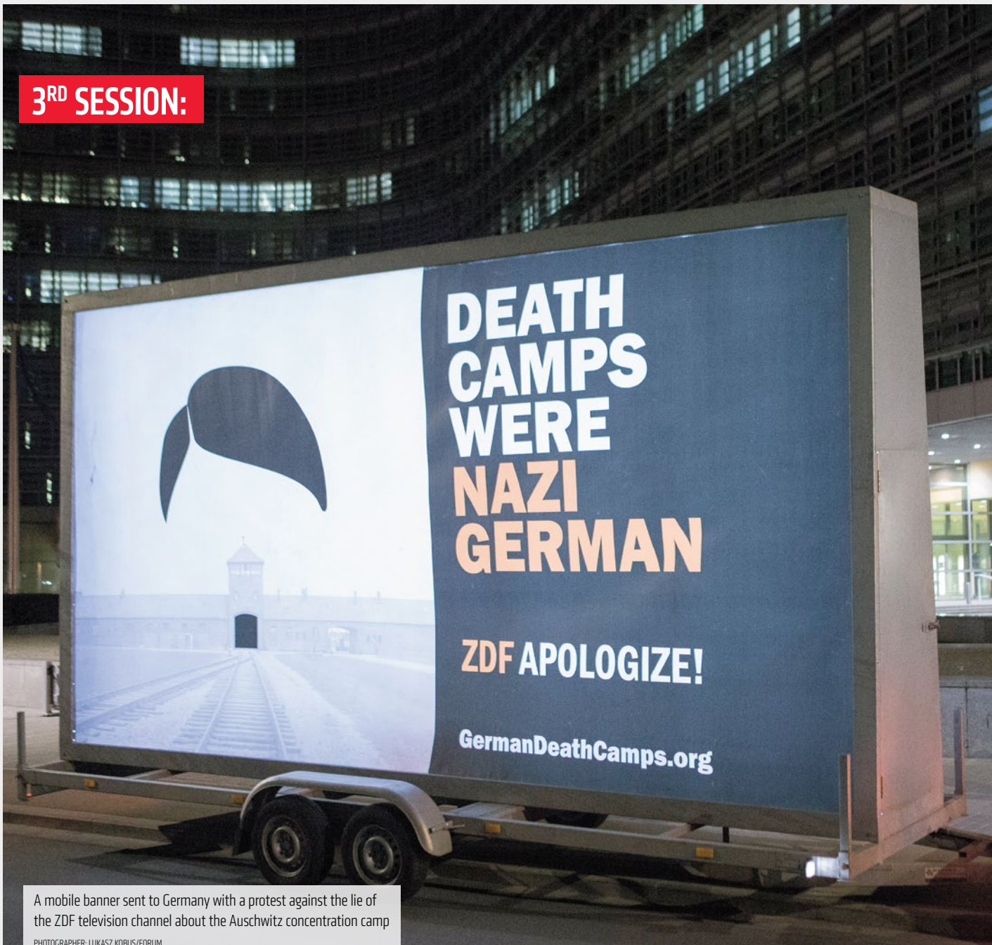
A mobile banner sent to Germany with a protest against the lie of the ZDF television channel about the Auschwitz concentration camp