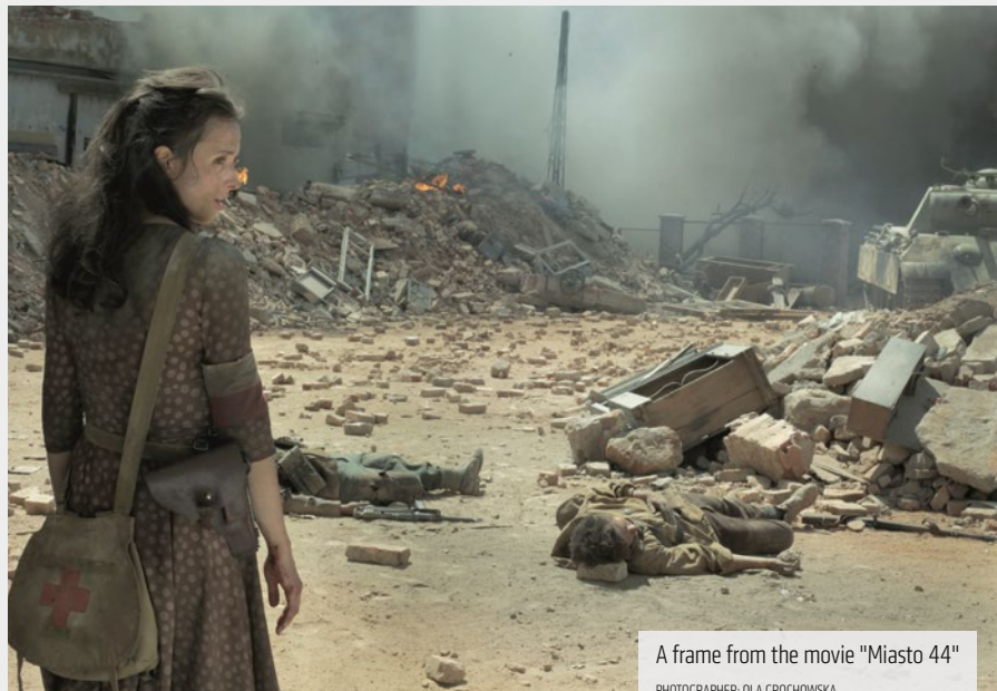
A frame from the movie "Miasto 44"

- This made us, lawyers, aware that something fundamental happened over the past 10 years in the sphere of historical awareness ... Changes in law acceptable ten years earlier were totally unacceptable, with additional safeguards, after ten years. And what has actually happened? - asked Minister Zbigniew Ziobro. - We should discuss the question why for decades, the Polish state has not engaged itself in the process of defending the historical truth about Poland, even