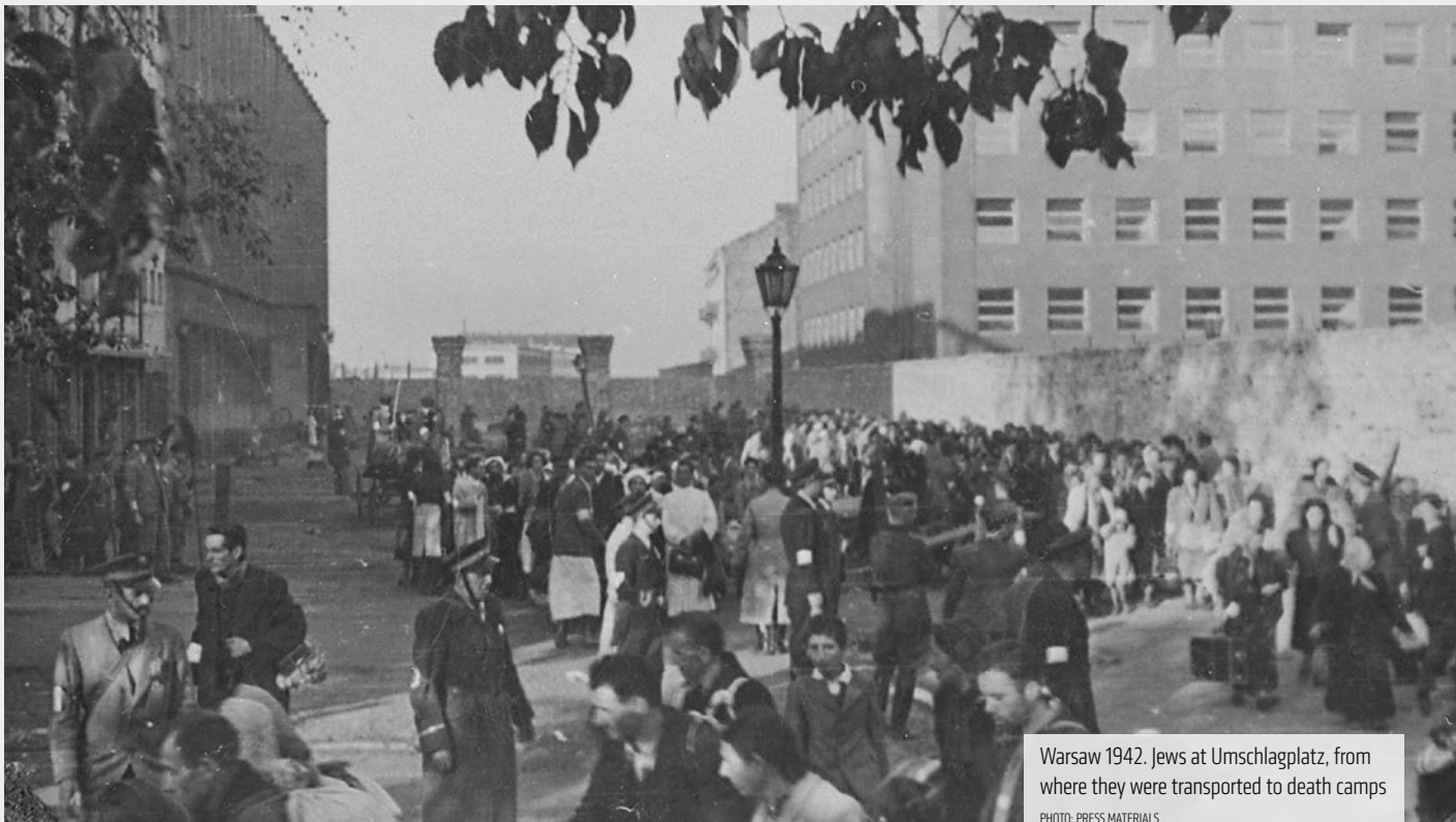
Warsaw 1942. Jews at Umschlagplatz, from where they were transported to death camps