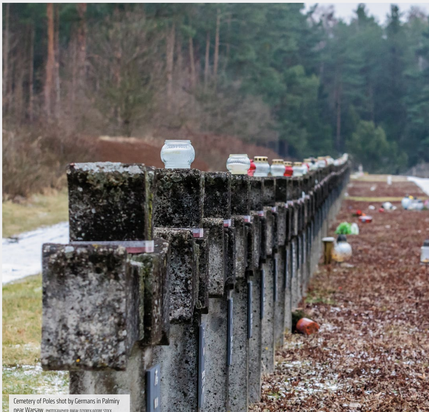
Cemetery of Poles shot by Germans in Palmiry near Warsaw